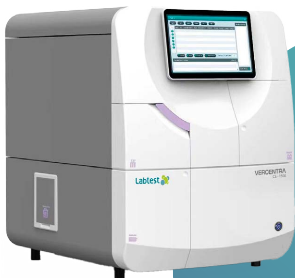
VERCENTRA CS-1500 UP to 120T/H

Benchtop, Magnetic Particles, Highly Integrated, Full panel