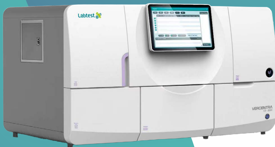
VERCENTRA CS-3000 UP to 240T/H